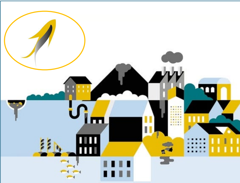
Minamata Convention in figures