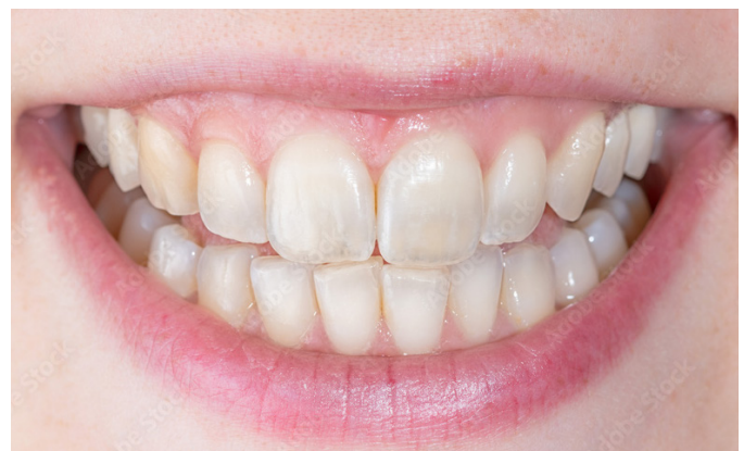
White Lesions (Incipient Caries)