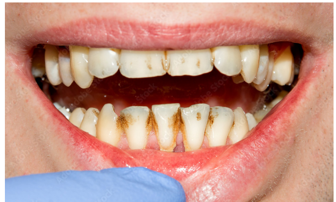
Severe Caries (Rampant Caries)