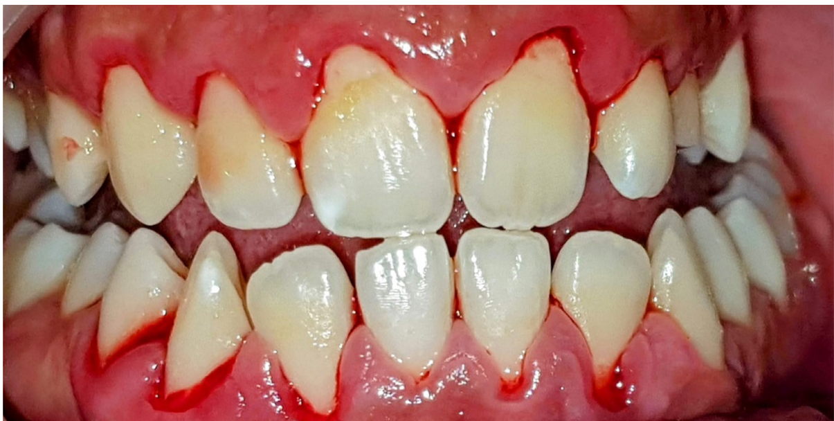
FIGURE 2. CLINICAL FEATURES OF GINGIVITIS.

If left untreated, gingivitis progresses to periodontitis [Figure 3].