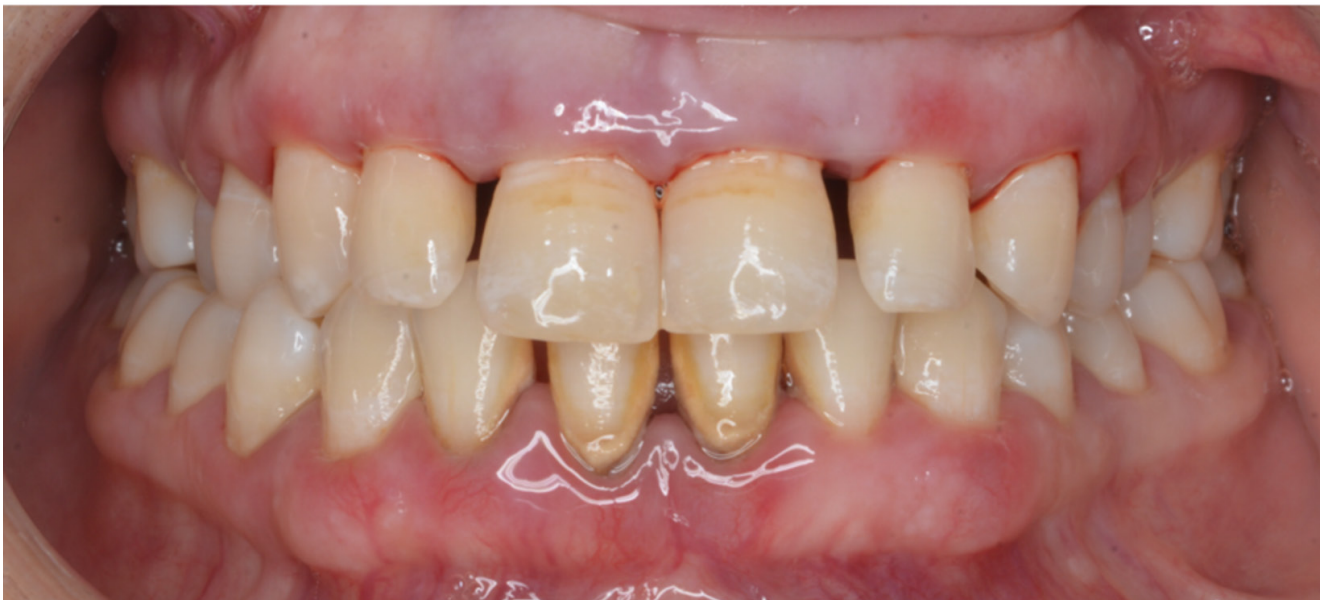
FIGURE 3. CLINICAL FEATURES OF PERIODONTITIS 2021 © by Dr Ali Sadiq