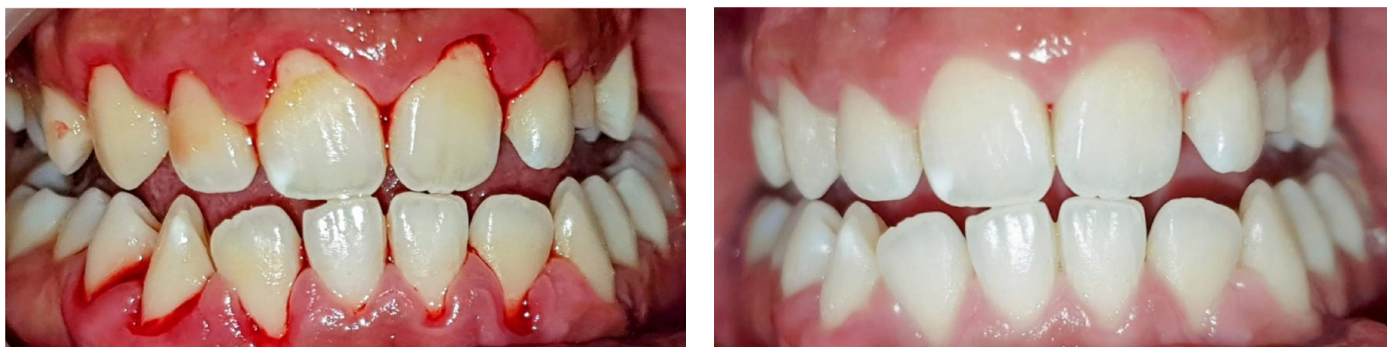
FIGURE 4. CLINICAL FEATURES OF GINGIVA IN DISEASE.

Left – immediately after professional mechanical prophylaxis) and in health