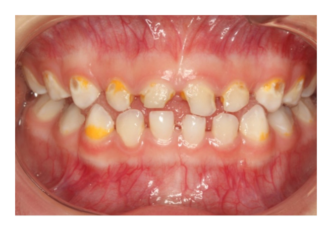
FIGURE B. VISIBLE DENTAL PLAQUE.